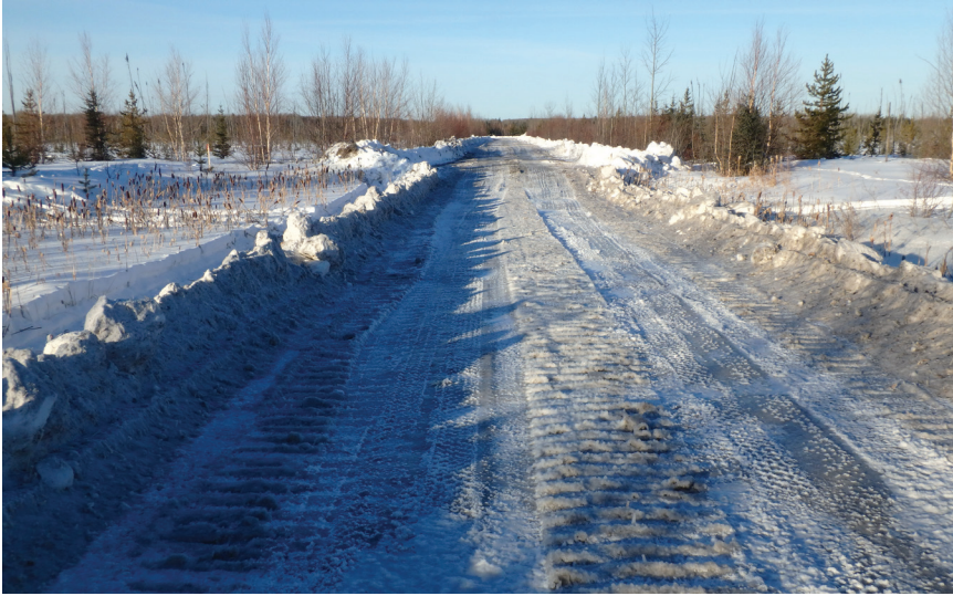
Figure 6. Frozen access road.