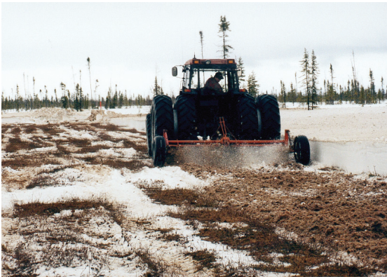
Figure 7. Rotary tiller on frozen ground.