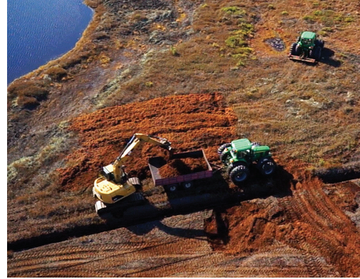
Figure 2. Collecting plant material after using a rotary tiller.