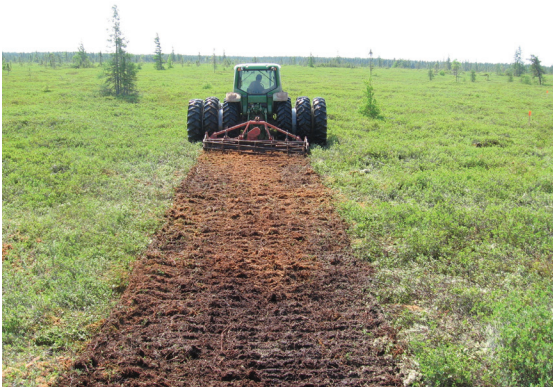
Figure 1. Rotary tiller shredding plants when collecting plant material.