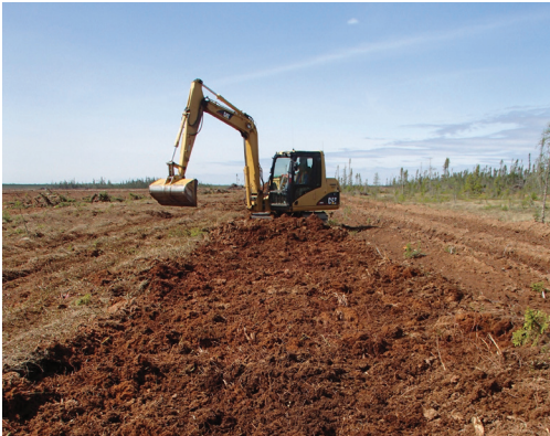
Figure 3. Collecting and picking up plant material with an excavator with wide bucket.