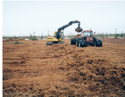
Figure 4. Collecting with a clamshell bucket after plant material has been stacked.