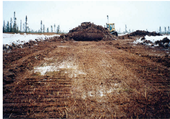
Figure 8. Stacking plant material collected on frozen ground.